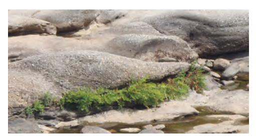
Figure 2 Vegetation supported by perineal spring flow from a fracture conduit.