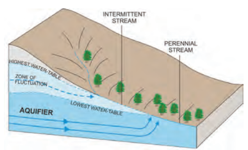
Figure 3 Vegetation density variation around a perineal stream in an area of fluctuating groundwater levels (after International Association of Hydrogeologists, 2016)