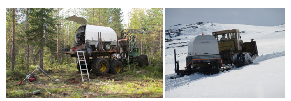
Figure 4 Examples of measurement locations. On the left Suhanko (Gold Fields Arctic Platinum Oy) and on the right Nussir mountain (Nussir ASA)