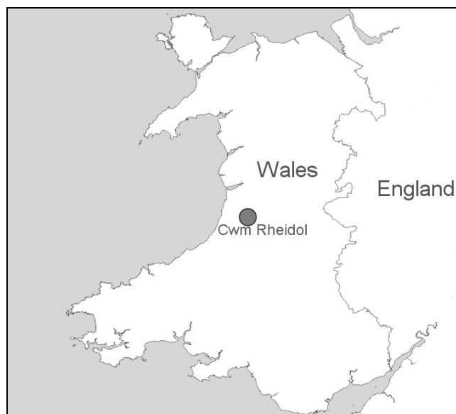
Figure 1. Location map of the study area.

The Cwm Rheidol metal mines complex is about 15 km east of Aberystwyth in Wales, UK (see Fig.1). The mines have not operated since the early twentieth century, but discharges of mine water threaten river water quality and wildlife. Environment Agency Wales (EAW) is managing a project to improve the mine site and reduce its impact, in partnership with the Welsh Assembly Government's Department for Enterprise, Innovation and Networks (DEIN) and The Coal Authority. The European Union (EU) has provided funding for the work through the Welsh Assembly Government under the Objective 1 programme.